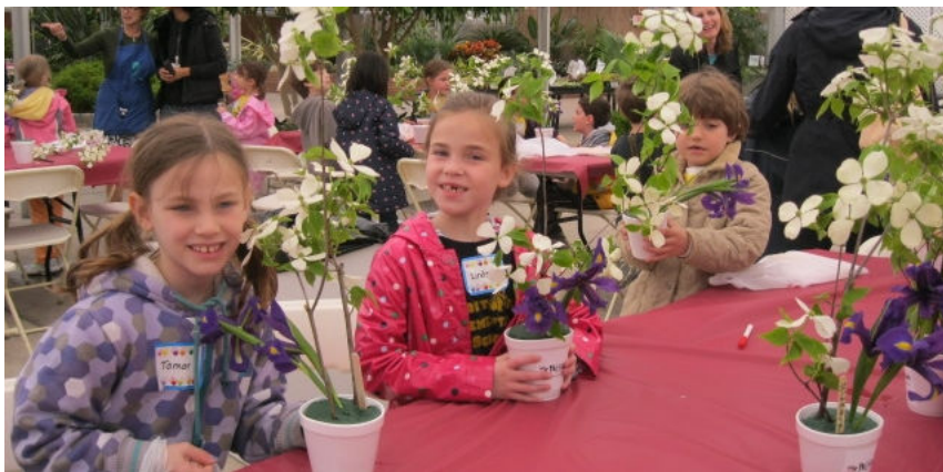
Students at Shofuso Children's Day.