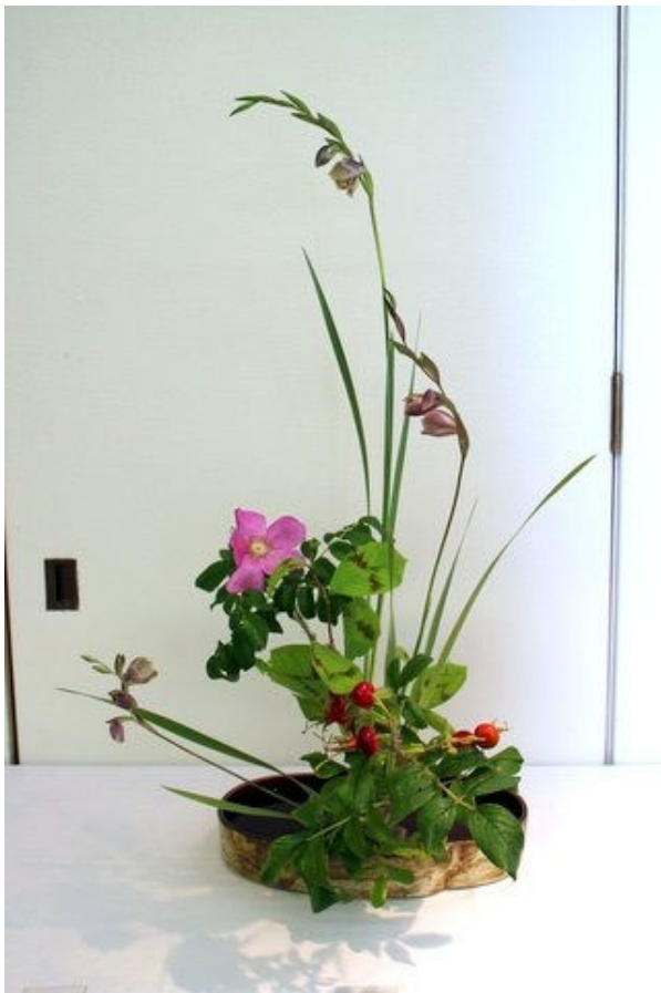
An arrangement from the demonstration.