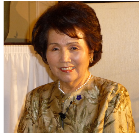
Young Yum