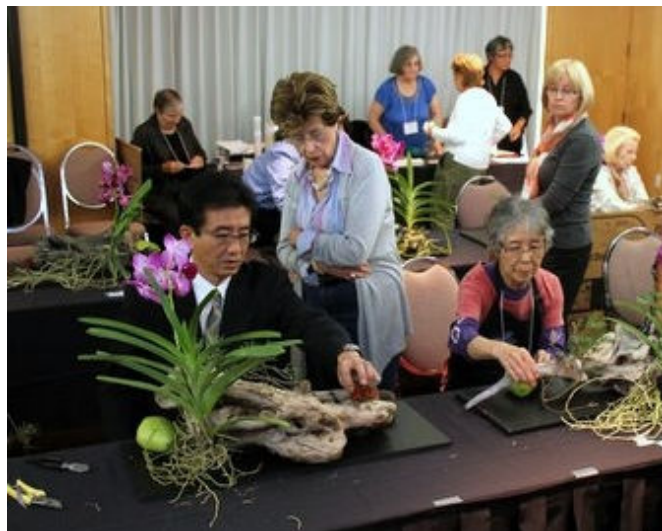
At the Workshops