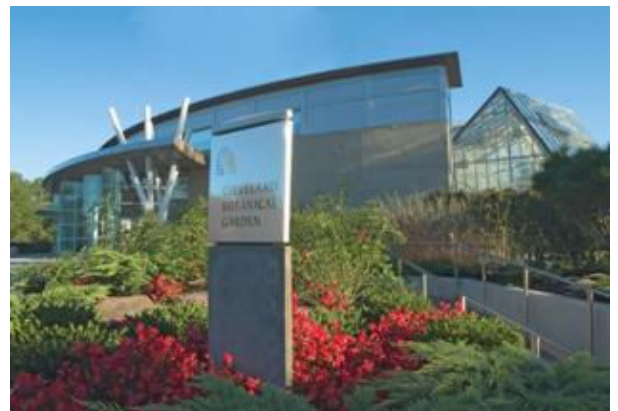
Entrance to the Cleveland Botanical Garden.

Be sure to mark the dates on your calendar and watch the Newsletter for information as details are worked out.